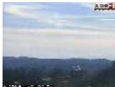
Huntington St. Mary's WebCam • Time-Lapse