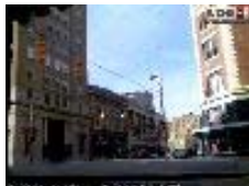
Downtown Huntington WebCam • Time-Lapse