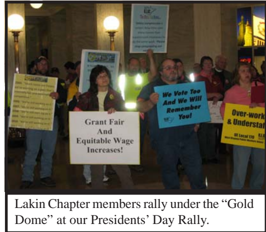
Lakin Chapter members rally under the "Gold Dome" at our Presidents' Day Rally.

UE-style independent political action involves educating, organizing and mobilizing our rank-and-file members to fight for their political interests. Over the past year, UE Local 170 members across West Virginia organized numerous meetings with their legislators to discuss their workplace problems and advance our legislative priorities, which culminated in our fifth annual Presidents' Day Rally in Charleston, where over one hundred Local 170 members and supporters rallied under the "Gold Dome" of the Capitol. Rally participants wore red bandanas, symbol of the West Virginia miners' insurrection of 1921, as a sign of solidarity with Wisconsin public workers.