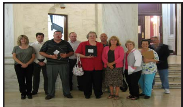
State IT workers from Office of Technology, DOT and Division of Labor outside of the House Chamber after attending the public hearing.