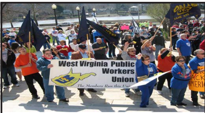
UE Local 170 members rally with hundreds of other union members in support of public workers at the Capitol.

In the coming months, UE Local 170 members will continue to fight the good fight, mobilizing collectively at our workplaces to improve our working conditions and defend our rights; rallying and marching in defense of workers' rights and jobs; meeting with our legislators to advance our legislative priorities; standing up to have our voices heard by the gubernatorial candidates; and most importantly, building our union in our workplaces across West Virginia.