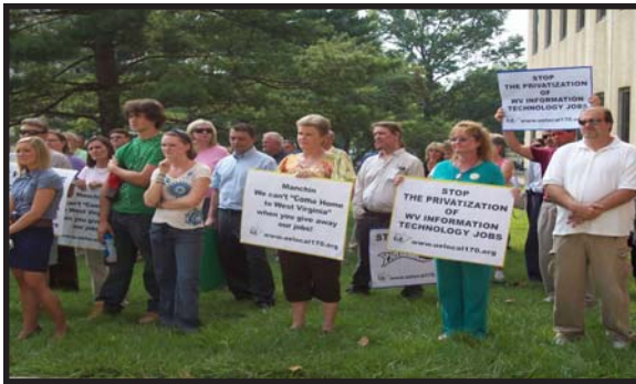
State IT workers and their supporters rally against the IT outsourcing scheme outside of Building 5.

Within days an organizing committee meeting was held at the union hall to put together a strategy to stop the IT outsourcing. The strategy called for organizing more state IT workers into our union and mobilizing them to lobby the WV Legislature; informing the public of the potential pitfalls and costs of outsourcing; and mounting a legal challenge to stop the outsourcing.