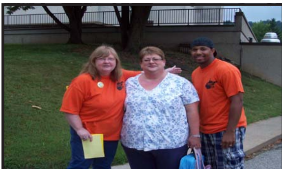
UE members greet a Culture Center employee.