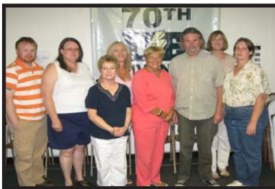
DHHR Chapter members meeting with Delegate Bobbie Hatfield.

As a result of our rank-and-file members' political action, UE Local 170 was able to get over a dozen bills introduced with multiple sponsors during this past year's legislative session, including several pay increase bills, and bills for seniority protection for state workers, WV OSHA reform, caseload standards for DHHR program areas, repeal of involuntary transfers, and compensation for DHHR employees for personal property loss at work. While we fought for a larger cost-of-living wage increase, we were able to help win the first pay increase for state workers in over two years. We were also successful in finally getting the legislature to begin to address funding WV OSHA for the first time in its 25-year history. In the coming months, UE Local 170 will continue to fight to advance our legislative priorities which were not passed this year, including improved wages for public workers.