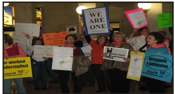
UE Local 170 members and supporters rally under the "Gold Dome" of the Capitol during our Presidents' Day Rally.