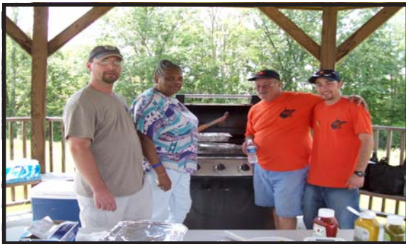
UE rank-and-file members from PA, NC, WV and VA demonstrate their hotdog grilling skills.