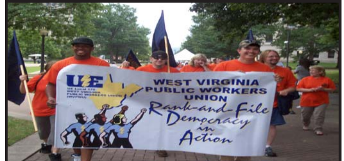
UE Young Activists lead UE members and supporters to Gov. Joe Manchin's office during the UE Organizing Blitz.

UE Local 170 rank-and-file members from across the state have been very active over the past year, building our union, advancing our legislative priorities and defending workers rights and jobs. From our fight to defend state information technology workers' jobs from being outsourced to our big organizing blitz last summer, our members have continued their activities this year, advancing our legislative priorities at the Capitol and defending workers' rights - marching and rallying across the state this spring.