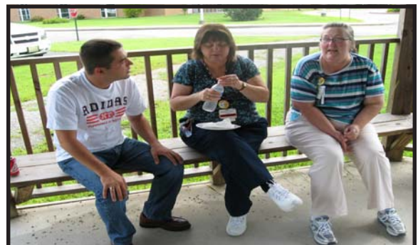
Sharpe Hospital employees talk about the merits of joining the union.