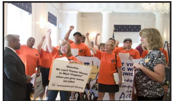
UE members let Gov. Manchin's spokesperson know how they feel about the IT outsourcing scheme.